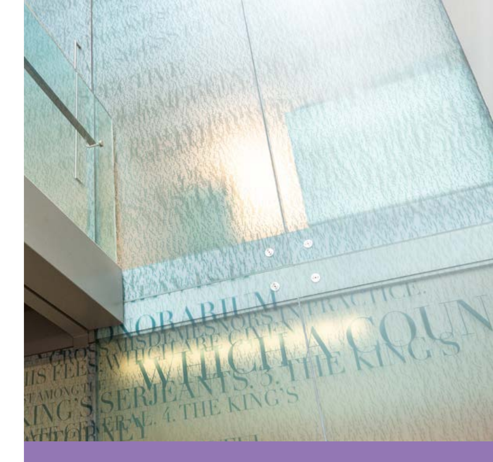
"Blackstone Chambers really is the go-to set for sports work" Legal 500

The Varnish case, however, was at the outer edge of what might possibly constitute an employment relationship. Given different facts – contractual arrangements that imposed a work for wage component and/or greater degrees of control, for example – the employment relationship line may well have been crossed.