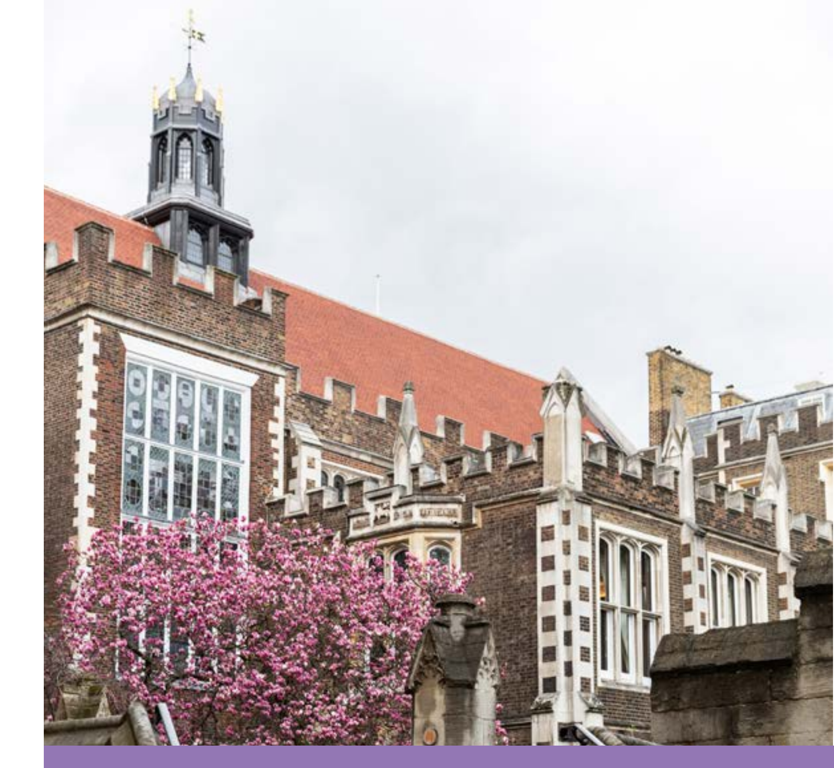
"Blackstone Chambers has a formidable reputation as a leading sports law set." Chambers and Partners